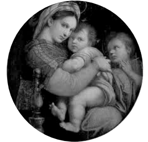
"Madonna of the Chair" Raffaello Sanzio da Urbino c. 1515