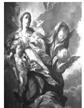
"The Assumption" Artist Unknown