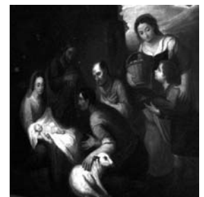
"The Nativity" Artist Unknown